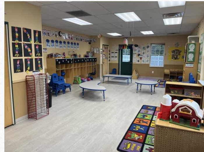
(Get Set classroom)