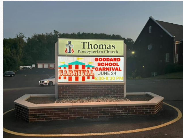
(The school's carnival night at a local church)