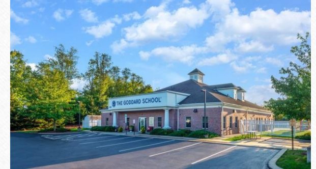
(Location I worked at)