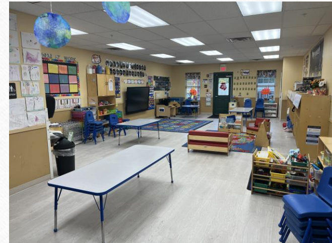
(Junior Kindergarten classroom)