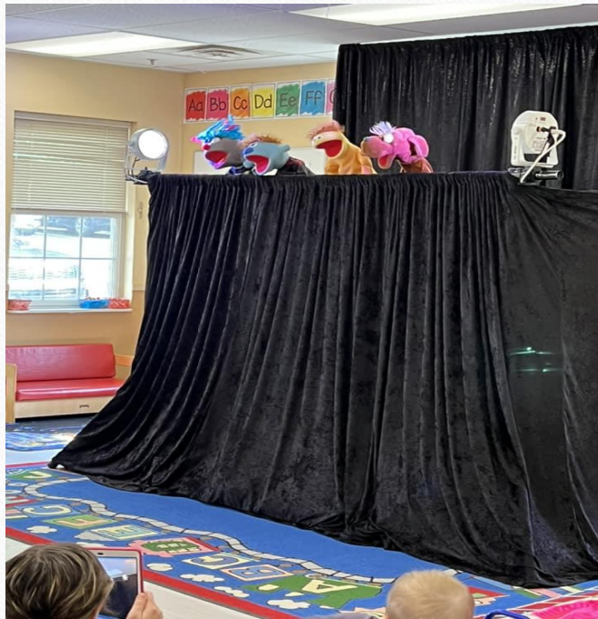
(A puppet show at the beginning of the school year)