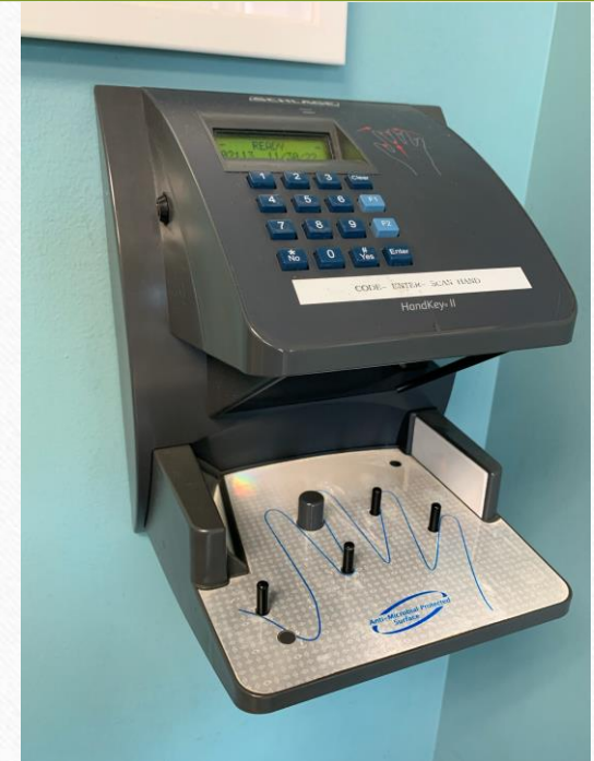
(Machine you use to enter your code and scan your hand to get into the building)