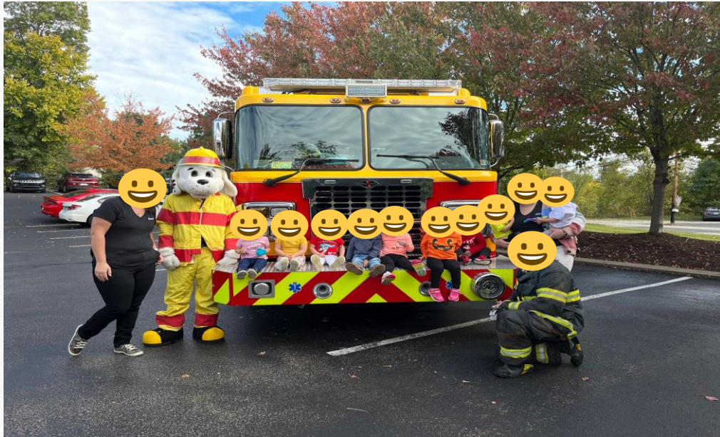
(Fire department field trip)