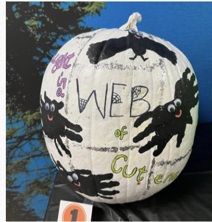
(Pumpkin decorating contest)