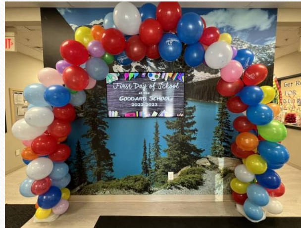
(First day of school decorations)