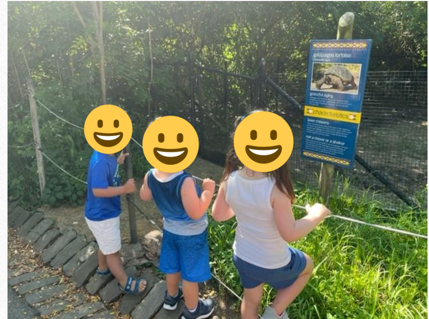
(Field trip to the zoo)