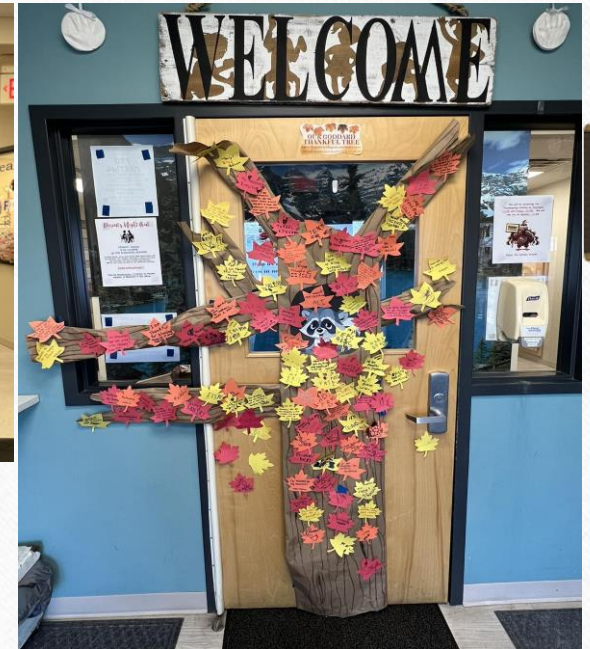
(Fall decorations on door leading to building)