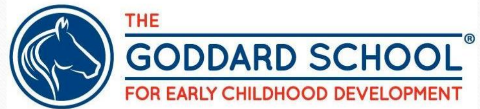
(Logo of the Goddard schools)