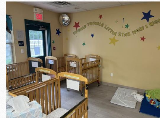
(Nap area in classroom)