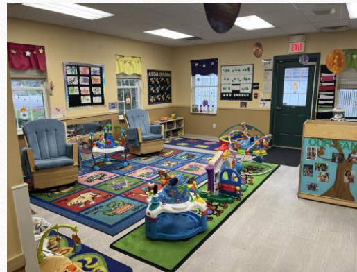
(Play area in classroom)