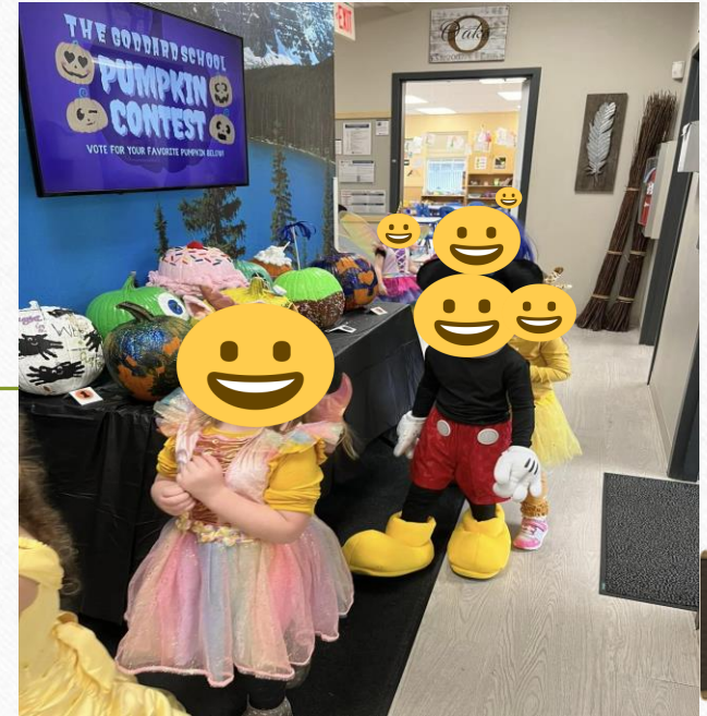
(Children showing off their Halloween costumes)