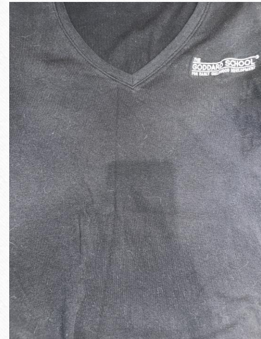
(One of the shirts that must be worn due to the dress code)