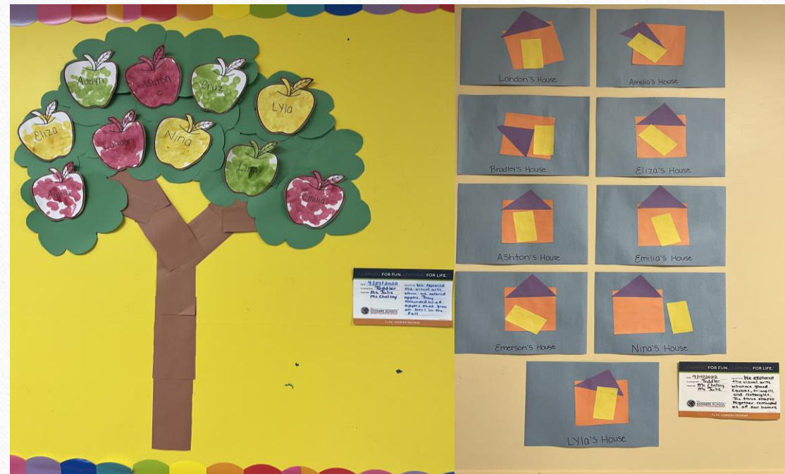
(Artwork from the Toddler classroom. Shows the children's schemas of apples and a house.)