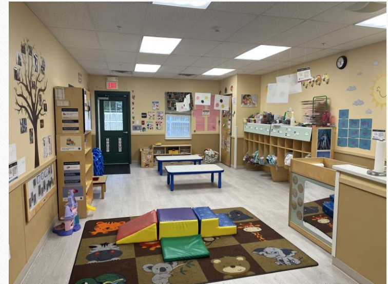
(First Steps classroom)